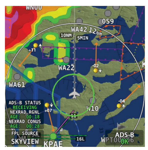
Traffic and Weather

No need to install a separate 2020-compliant ADS-B Out solution - SkyView HDX has you covered.