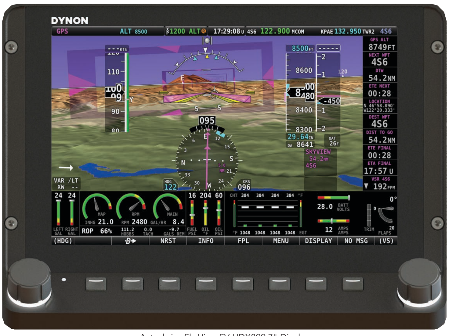
Actual size SkyView SV-HDX800 7" Display