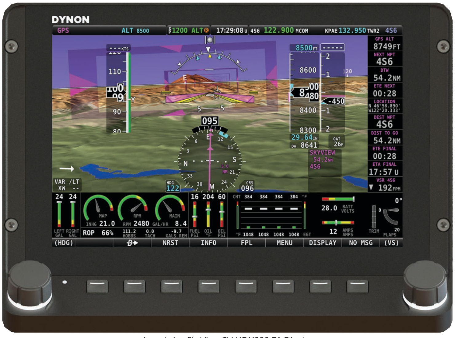
Actual size SkyView SV-HDX800 7" Display