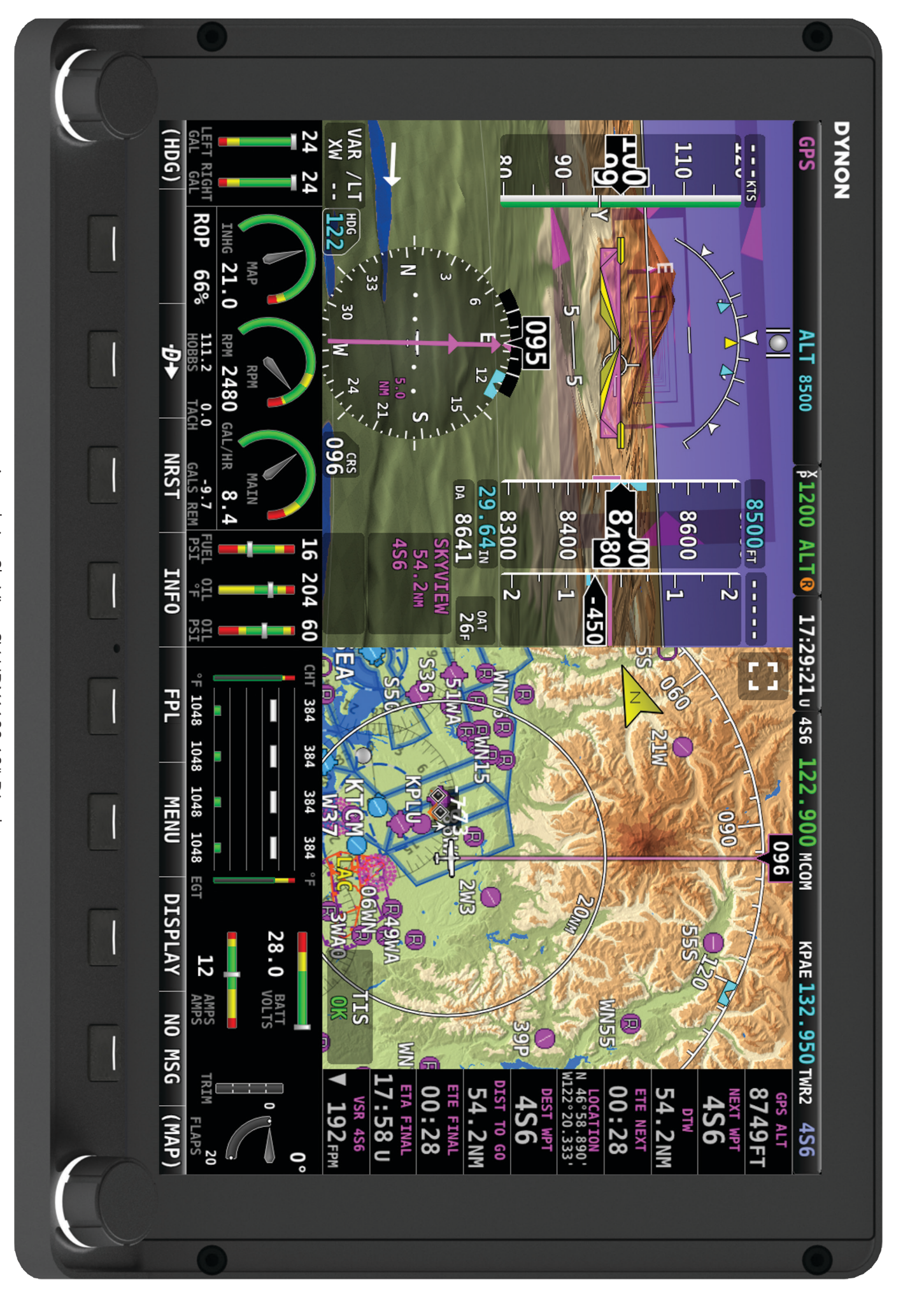
Actual size SkyView SV-HDX1100 10" Display For planning use only. Do not use as a panel-cutting template.