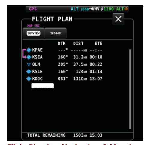
Flight Planning, Navigation, & Mapping

Gain superior situational awareness with full ADS-B In Traffic and Weather.