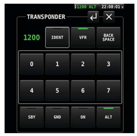
Mode S Transponder with 2020-compliant ADS-B Out

All the tools you need - including % power - to effectively manage your powerplant whether you're a rich or lean of peak fan.