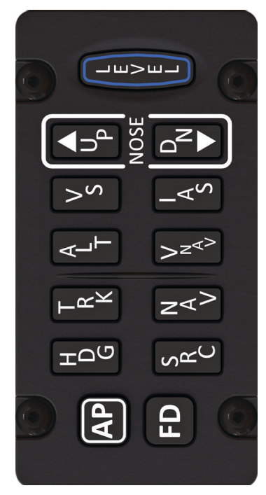
Actual Size Control Panels For planning use only. Do not use as a panel-cutting template.